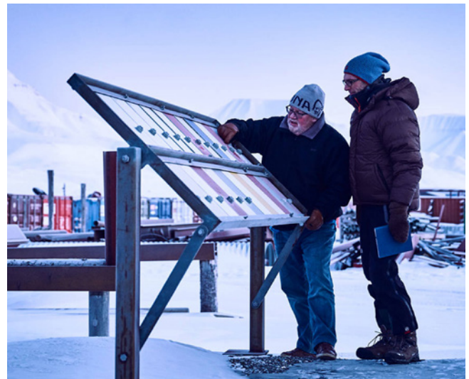
Jotun's Arctic test station located at Svalbard in the upper Arctic Circle

Proven all-climate performance - tested at the world's only Arctic test station for paints and coatings, as well as in extreme desert and sub-tropical environments around the world.